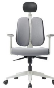
White Frame (D2A-04HA-SW)