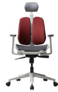
White Frame w/ Mesh Seat (D2A-04HA-MW)