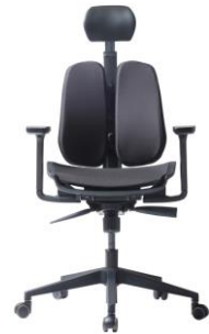
Mesh Seat (D2A-04HA-M)