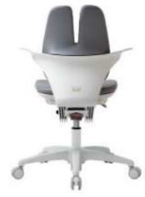
Without Footrest (RA-070LD)