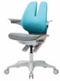
Mesh Seat (RA-070M)