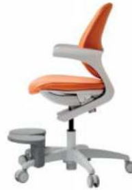
Without DUALINDER (RA-070LF)