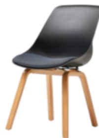
QL61W Wooden Leg