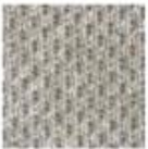
EK34-G03 (Light Gray)