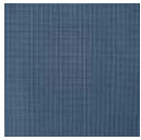
Mat Mesh Grey (7QGY1)