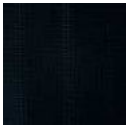
Mat Mesh Black (7QBK1)