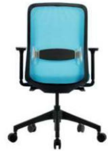
Without Headrest (QU-450C)